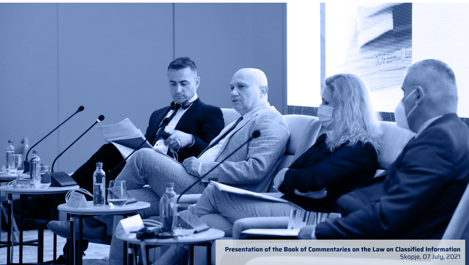
Presentation of the Book of Commentaries on the Law on Classified Information Skopje, 07 July, 2021

DCAF continues to support regional dialogue and good practice exchanges on the use of intelligence information in Courts. The regional judicial conference entitled “ The Admissibility of (Counter) Intelligence Information as Evidence in Courts ” was held online on 30 September 2021 . The conference brought together more than 50 practitioners and academics from Southeast and Eastern European countries, to exchange experience, to discuss the current state of play and challenges in the use of intelligence information as evidence in court in criminal investigations. The event is the second in a series of regional judicial conferences initiated in March 2021, co-organized with DCAFs Justice and Security Programme in Bosnia Herzegovina. It is designed to promote judicial practices aligned with European principles and the highest human right standards, and to foster regional legal assistance in the Western Balkans.