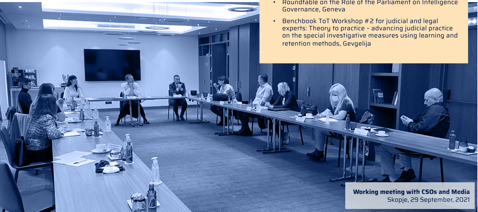
Working meeting with CSOs and Media Skopje, 29 September, 2021